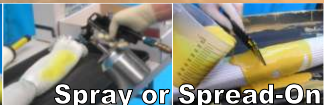
Spray or Spread-On